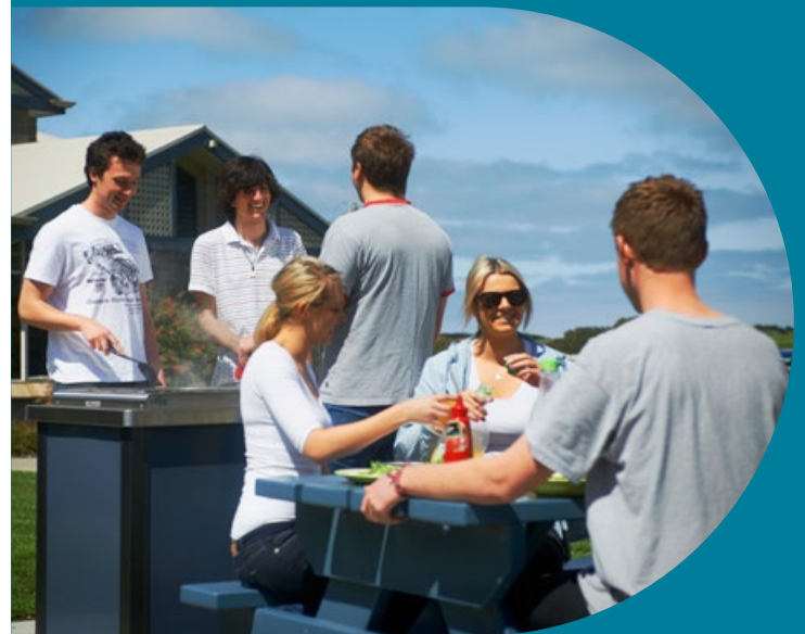
Students enjoying a barbeque outside of the Warrnambool accommodation

Find out more and register at deakin.edu.au/openday Choose your campus and select Getting There